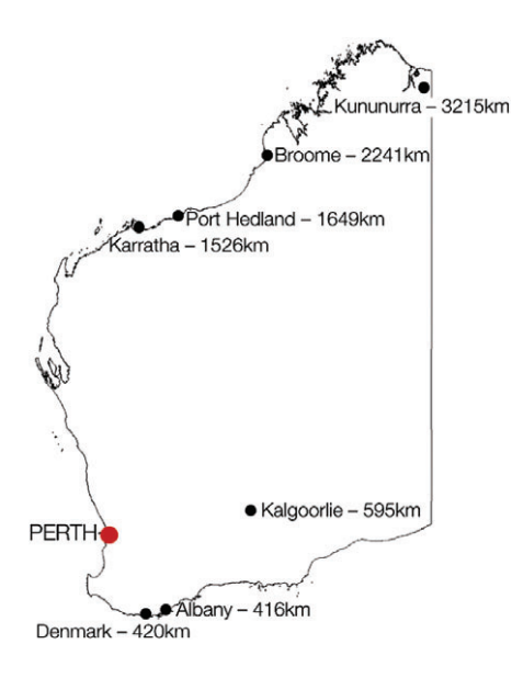
Figure 1. Map of Western Australia demonstrating video consultation sites and distance from the state capital, Perth

video consultation with LOV in a threemonth period commencing 6 July 2015. Ethics approval for this project was granted by the Human Research Ethics Committee at the University of Western Australia, in accordance with requirements of the